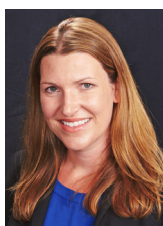
GEORGIA Z. SCHNEIDER Ponist Law Group

This is distinguishable from a situation where there has been a physical invasion of the property and a loss of view. The California Supreme Court has recognized that there is a “compensable visibility interest when government action that includes a partial physical taking of a landowner's property impairs the visibility of its remainder.” Regency Outdoor Advertising, Inc. v. City of Los Angeles , 39 Cal.